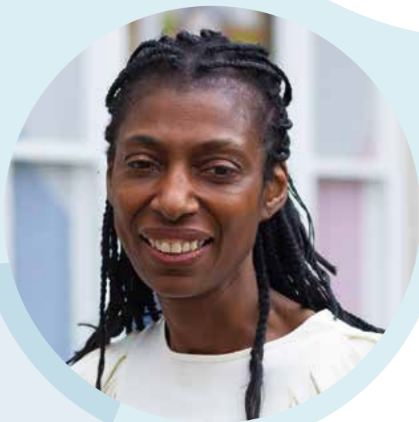
Dame Sharon White